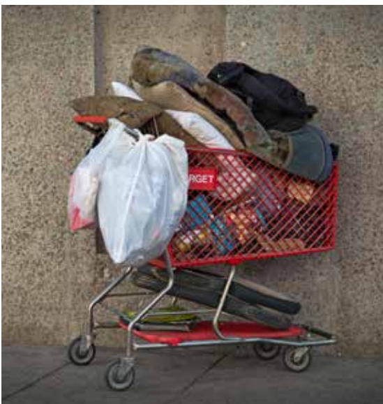
Shopping cart carrying all the belongings of a homeless person

If we look at the writings of, say, the Church Fathers of the fourth century, they regularly preached sermons criticizing material excess and echoed the biblical call to help the poor as the way to store "treasure in heaven." But with the rise of monasticism (and, it must be admitted, in the West, the disappearance of most excess wealth