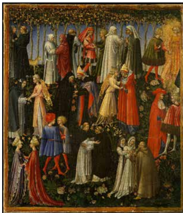
Paradise, Giovanni di Paolo