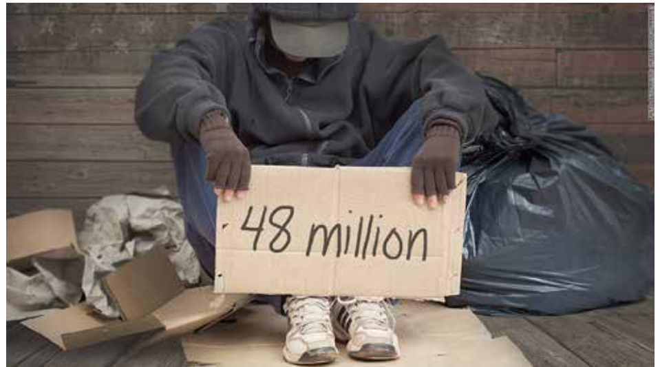
Number refers to past food insecure Americans, currently estimated at "only" 37 million

I, like many others, have been inspired by Dorothy's example. When we see Dorothy's commitment to the poor, not from the outside, but from the inside, we do see Christ in action. But it's important not to be overwhelmed by her striking example. When I've done parish presentations on my book, I end with a slide where I have pictures of Dorothy, Mother Teresa, and Thomas Merton. From a very early age, these people were my spiritual