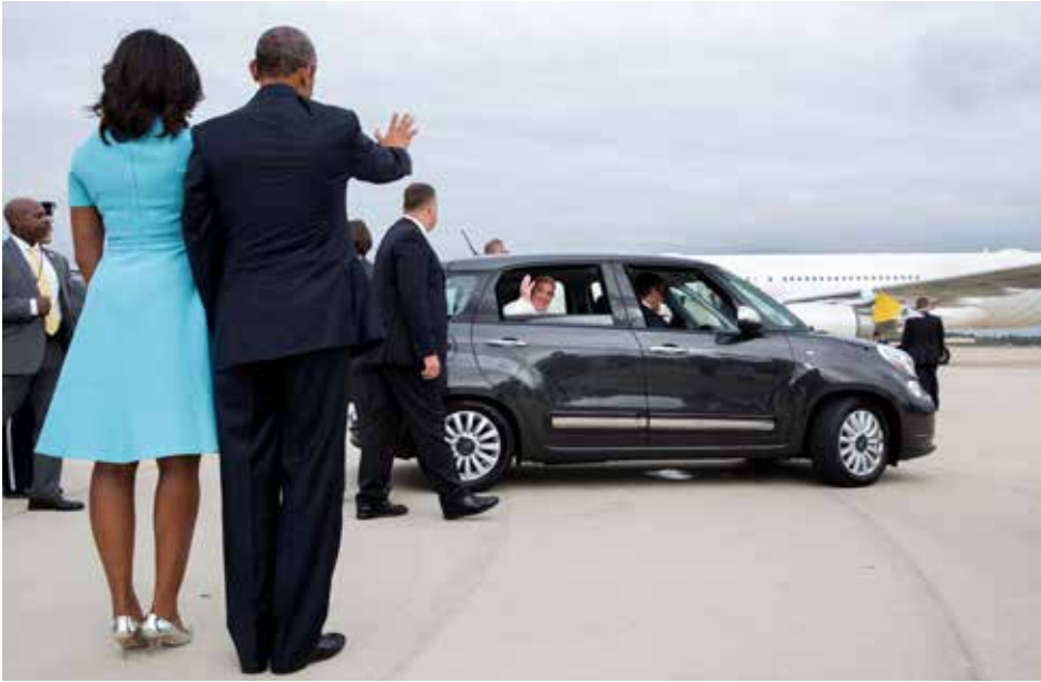
President and Mrs. Obama wave good-bye to Pope Francis as he leaves in his modest sized travel car

it. There are moments like that in the Christian life. But Dorothy recognized that there was “more” to abundance, and the “more” was not so much a further soaring feeling but a full descent into the lives of others. The great Lord of the